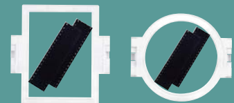
Optional snap-together rough-in-frames available separately for new-construction applications.