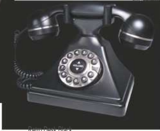
Retro Desk Black