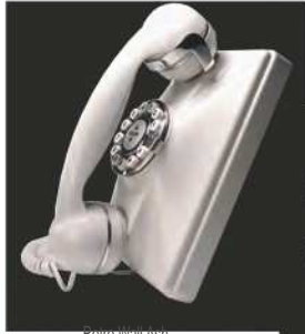
Retro Wall Ash

Single-line desk and wall phones, designed for the most demanding environments. Available in Ash or Black. Data port included on most models, optional message light.