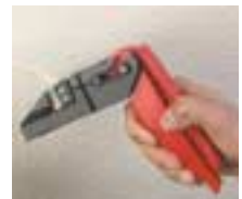
5. Pull trigger completely.