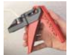
4. Ensure jack is completely and securely inserted in jack holder bed with IDC slots facing the blades.