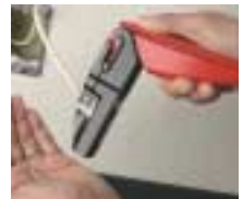
6. Wires will be seated and cut for a solid termination.