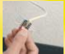
2. Determine wiring scheme. Dress all 4 pairs (8 wires).