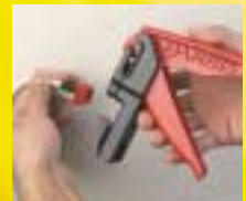
3. Insert jack in JackRapid front first with IDC slots facing blades of JackRapid.