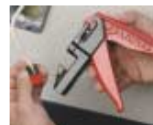
7. Release handle and remove jack from JackRapid tool. Visually verify proper termination.