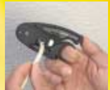
1. Strip cable jacket.

41106 (6-wire) 41108 (8-wire) 5G108 (8-wire)